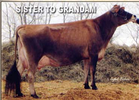
SISTER TO GRANDAM