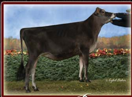
Lookout CF Smokin Baby J - 97522 Reserve Junior Champion, All American Jersey Show All American Summer Yearling Heifer Res. Junior Champion, KS State Fair 9 th Summer Yearling, Central National