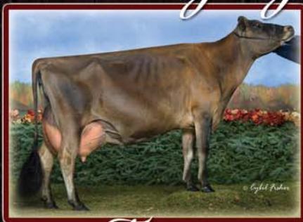
Ratliff Juno Madison-ET, E-93% 4-0 305 21,720 4.3% 937 3.2% 699 92DCR 8 th Aged Cow, All American Show 3 rd Aged Cow, Central National Show Res. Grand Champion, KS State Fair