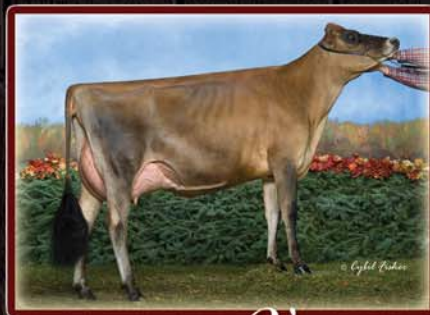
Ratliff Sultan Venus 7 th Milking Senior Yearling, All American Show 6 th Milking Senior Yearling, Central National Show