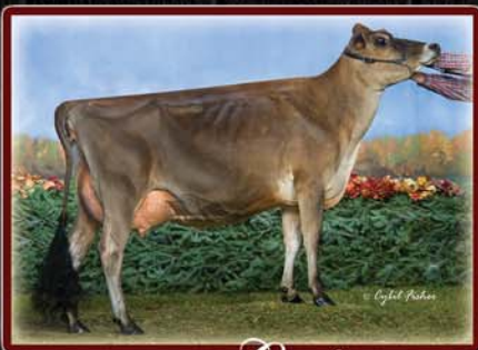
Valhalla Indiana Lucky, VG-88% 2-5 303 14,860 4.7% 701 3.4% 512 92DCR 3 rd Junior 3-year-old, All American Show 10 th Junior 3-year-old, Central National 2 nd Junior 3-year-old, KS State Fair 1 st Junior 3-year-old, Southern National

Reserve Premier Breeder of The All American Jersey Show