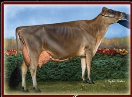
Ratliff D Dean Allie-ET, E-95% 3-0 305 22,120 5.0% 1,110 3.7% 812 92DCR Reserve All American Aged Cow 4 th Aged Cow, Central National Show 2 nd Aged Cow, Kansas State Fair 4 th Aged Cow, WI Spring Spectacular Show Senior Champion, Southern National Show