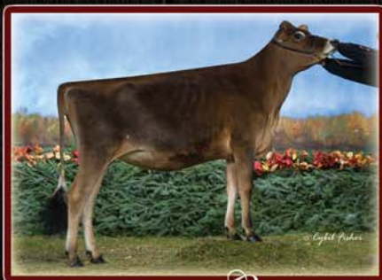
Ratliff Suspect Carly 3 rd Int. Yearling, All American Show 3 rd Int. Yearling, Central National Show 1 st Int. Yearling, KS State Fair Res. Junior Champion, Southern National