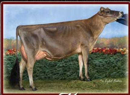
Ratliff Sambo Magnolia-ET, VG-89% 2-0 305 16,770 4.0% 671 3.5% 587 94DCR 6 th Senior 2-year-old, All American Show 4 th Senior 2-year-old, Central National 4 th Senior 2-year-old, WI Spring Spectacular Res. Int. Champion, Southern National